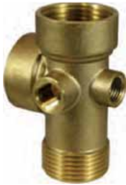
1" x 80 mm 5-way Connector