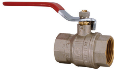
Fullway Ball Valve F.F. 1" - 4"