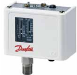
Pressure Switch KP 35