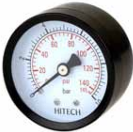
Pressure Gauge 0-10, 1/4"