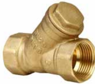
Sieve Filter 1" (Y Strainer)