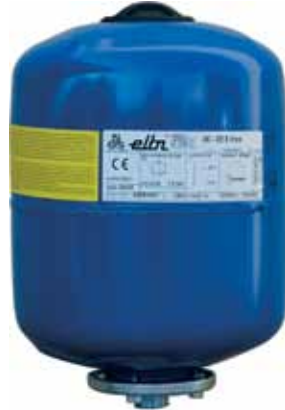
Pressure Tank 24 litres