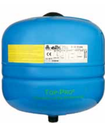
Pressure Tank 24 litres

HITECH SYSTEMS presents you with world class Italian products manufactured by M/s. Elbi, Italy, M/s. Valbrass, Italy and M/s. Faes, Italy. The products are manufactured with good quality and high accuracy adhering to International standards which are used in Pressure Boosting Pumps.