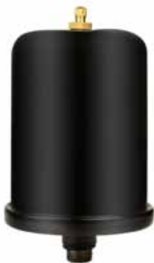
Pressure Tank 2, 3 litres