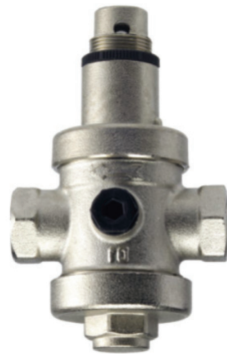
Pressure Reducing Valve (PRV) F.F. PN 25 1/2" - 4"