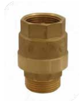
Non Return Valve M.F 1"