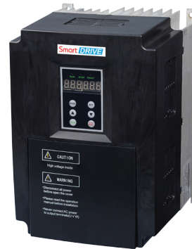
Smart DRIVE Variable Frequency Drives and Solar Inverters for Pumps