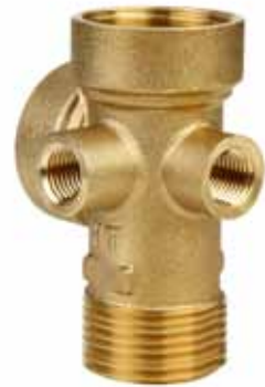
1" x 80 mm 5-way Connector