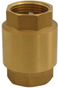
Check Valve PN 25 (NRV) - 1" - 4"