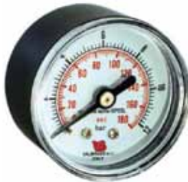
Pressure Gauge ABS Ø40 Back Connection 0-12 , 1/4"