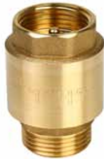
Non Return Valve M.F 1"