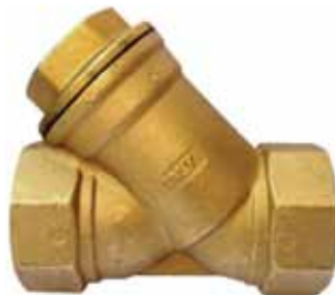
Sieve Filter 1" (Y Strainer)