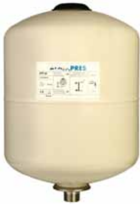
AQUAPRES Pressure Tank 24 litres