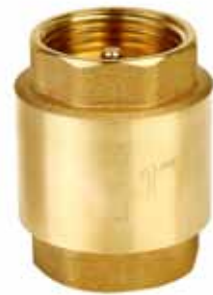
Non Return Valve 1"