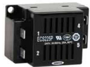
Electronic Centrifugal Switch